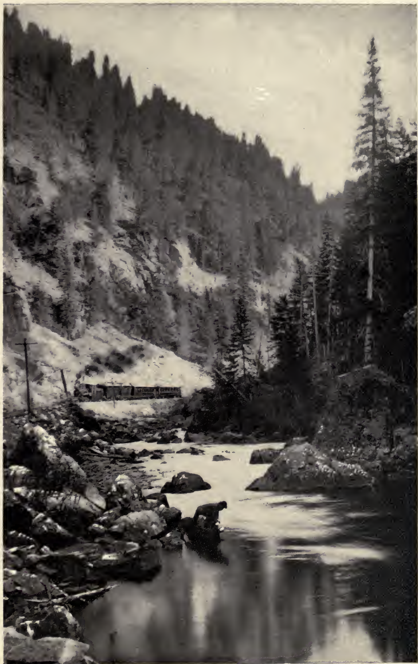
EAGLE RIVER CANON BETWEEN LEADVILLE AND GLENWOOD SPRINGS